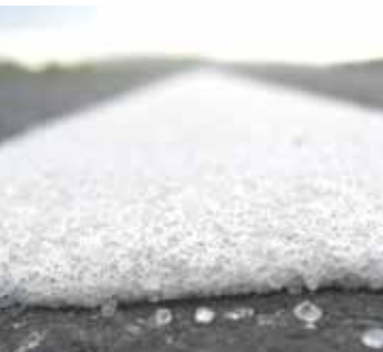
Site Visitor Safety Information